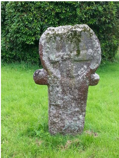
John L Bell

5. Lord, your summons echoes true When you but call my name. Let me turn and follow you And never be the same. In your company I'll go Where your love and footsteps show. Thus I'll move and live and grow In you and you in me.