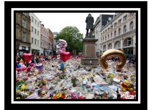
St Ann's Square with tributes after the 2017 Manchester Arena bombing, viewed from St Ann's Church

As some of you may know, I still have strong links to Manchester and, when I am there, I attend St Ann's Church.