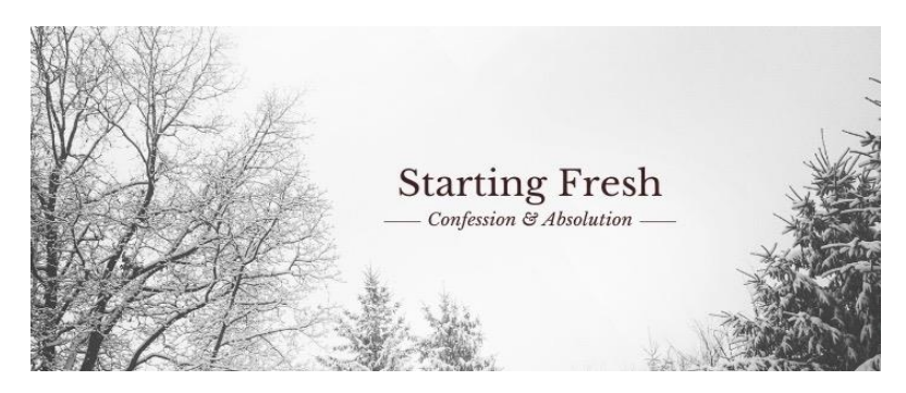
Jesus said, "Before you offer your gift, go and be reconciled".

Breathe on me, Breath of God, So shall I never die, But live with you the perfect life Of your eternity.