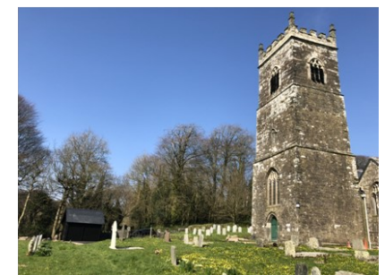
The Camel-Allen Benefice